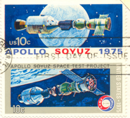
First Day of Issue